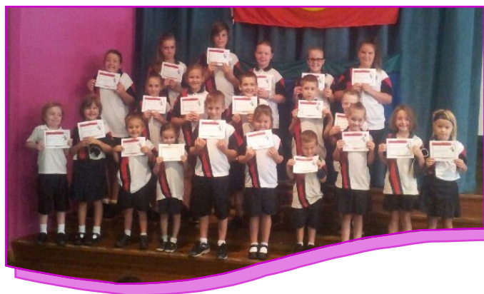
Photo: Our wonderful Safe, Respectful and Responsible students from Week 7.

At WPS staff, students and community are Safe, Respectful and Responsible.