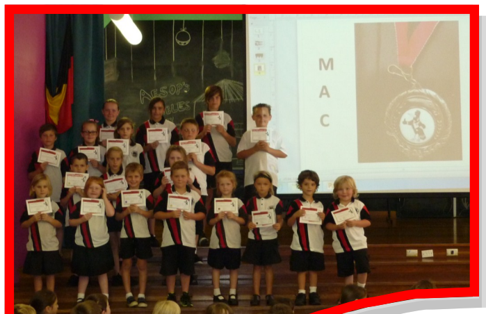
Photo: Our wonderful Safe, Respectful and Responsible students from Week 10.

This week's focus for PBL is the Reward System at Weston PS. As shown on page 6 of this week's Bulletin.